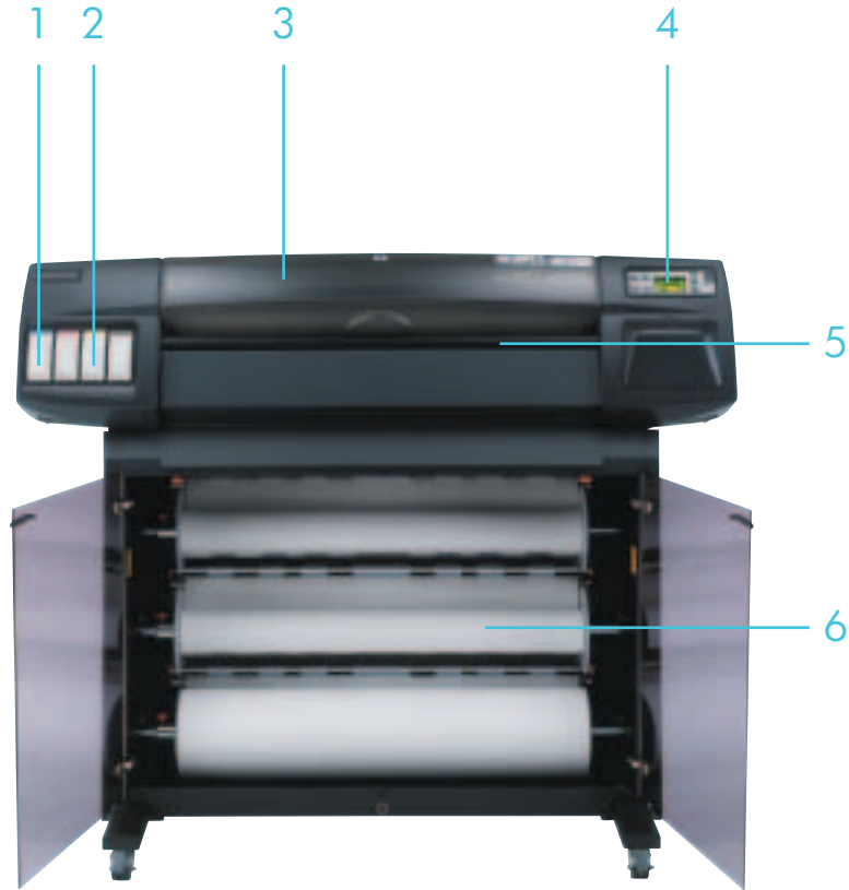
HP Designjet 1050C Plus and optional HP Designjet Multi-Roll Feeder shown