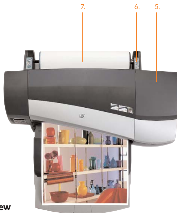
HP Designjet 90r Printer top view

Modular ink system with six independently replaceable ink cartridges allows you to replace only the ink colors you need.