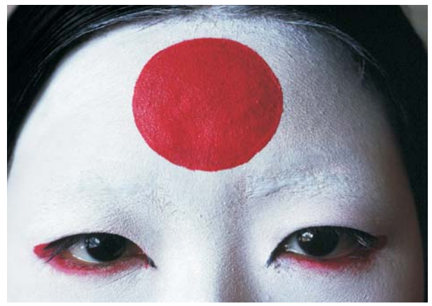
'Japanese Face'

Dye-based HP Vivera inks provide rich color depth, minimal dot visibility, and uniform gloss-all important attributes of image quality.