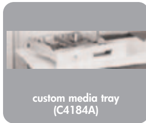
custom media tray (C4184A)