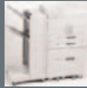
hp 3000-sheet stacker (C4779A)