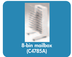
8-bin mailbox (C4785A)