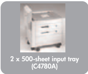
2 x 500-sheet input tray (C4780A)