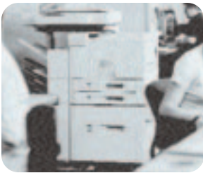
2000-sheet input tray (C4781A)

Floor-standing output device that stacks up to 3,000 sheets and provides automatic job offset capabilities for easy handling and job separation. The 3000-sheet stapler/stacker provides in-line multi-position stapling (up to 50 sheets) enabling the creation of a wide range of documents ready for distribution in just one step, right from your desktop.