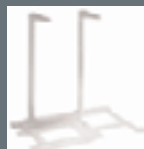
copy module stand (C4231A)

Three options which provide an efficient, cost-conscious means of controlling department output. The mailboxes are ideal in a shared environment, providing output assignment by department, workgroup or individual, for simplified job identification, separation and retrieval. The 5-bin mailbox provides stapling capabilities (up to 20 pages) and stacks up to 350 sheets in the stapling bin.