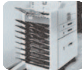
7-bin tabletop mailbox (C4783A)