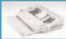
automatic duplexer unit (C4782A)