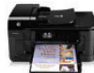
HP Officejet 6500A e-All-in-One